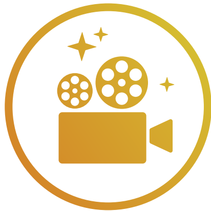
MOVIES UNDER THE STARS

Be on the look-out, you may see some familiar friends palling around!