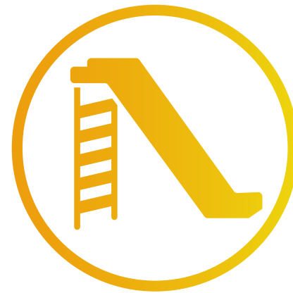
PLAYGROUND 2 LOCATIONS