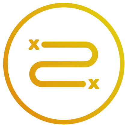
WALKING / JOGGING TRAILS